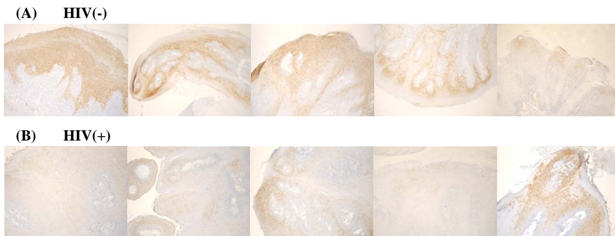
Fig. (2). Immunoperoxidase staining for cytokeratin 17. Variable staining of suprabasal keratinocytes is shown in papillomas removed from the oral mucosa. The overall observation is that of decreased staining intensity of oral papilloma keratinocytes in the HIV(+) patients (B) as compared to papillomas found in the HIV(-) patients (A) (100X), corroborating the iTRAQ quantification trend.